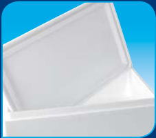
EPS Box List