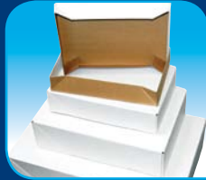
Waxed Cardboard Boxes